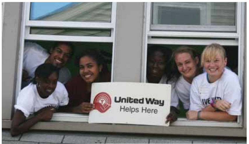
Each year we benefit from teams of community volunteers on the United Way's Day of Caring