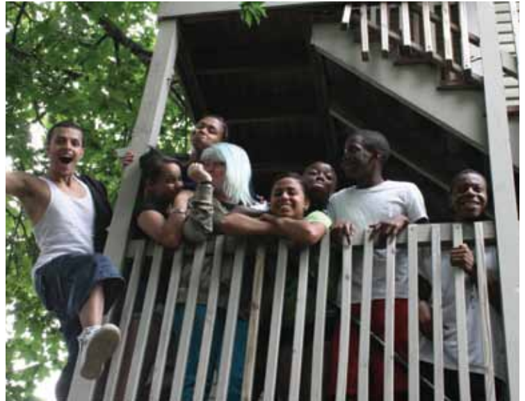
Through the city's Summer Jobs for Youth program, we hire teens to plant and maintain the Green Island Gardens