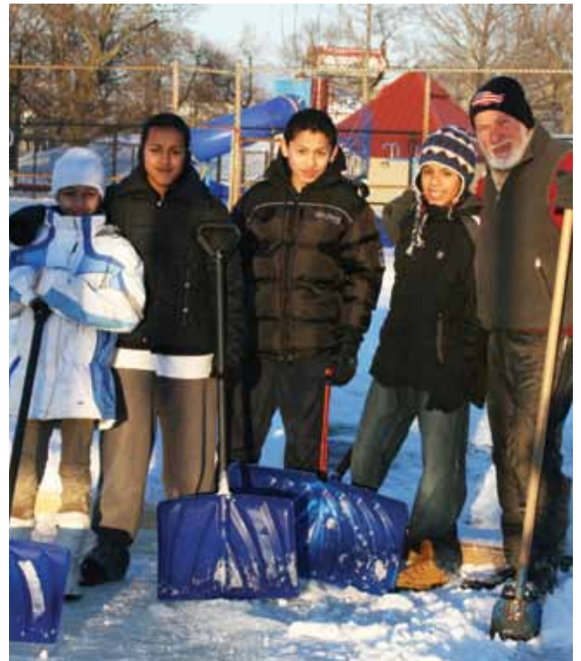
Building and grooming the ice rink in the Crompton Park is a great way to enjoy winter