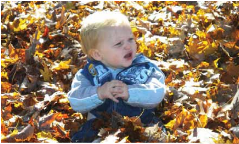
Early Intervention helps toddlers enjoy and learn from their world

This is our most up-to-date list of donors and foundations at press time and we regret any omission or errors made.