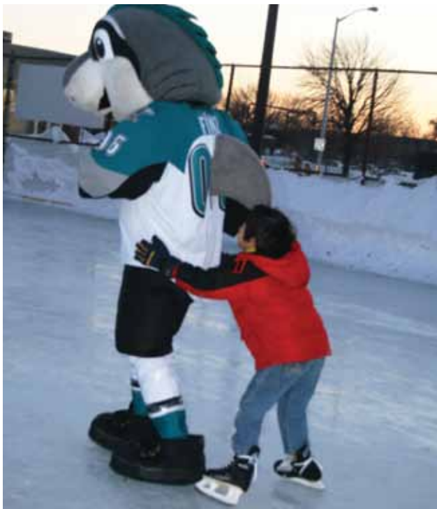
A young skater plays "Follow the Leader" with Finz, Mascot of the Worcester Sharks