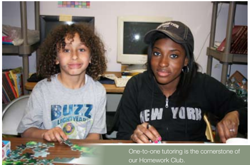
One-to-one tutoring is the cornerstone of our Homework Club.