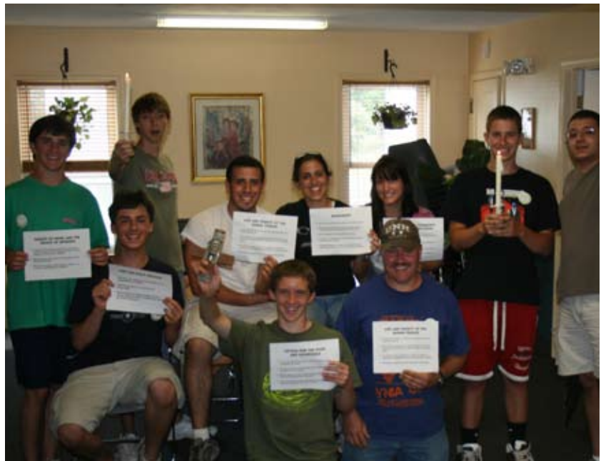
Young Neighbors in Action St. John of the Cross Parish, Middlebury, CT.

Please remember Pernet Family Health Service in your will, estate planning, bequests, or in requesting donations upon the death of a loved one. Thank you.