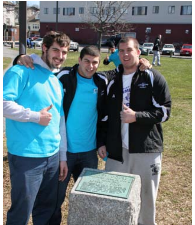
Holy Cross Cares day volunteers pose at the Bob Cousy marker in Compton Park.